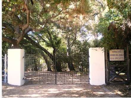
Orcutt Ranch gate, September 2008