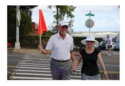
Flags can also be used to help with traffic at drop off and pickup locations at schools.