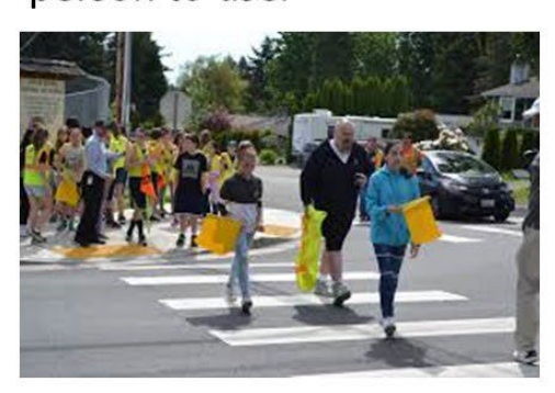
Program sponsorship TBD. Typical sponsors are school in conjunction with WHNC

- and uses it to wave at cars while he or she is crossing the crosswalk. That helps get the attention of people driving. When the walker is safely on the other side, he or she deposits the flag at an identical bucket for the next person to use.