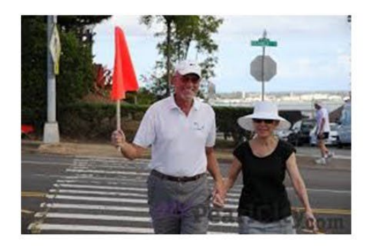
Flags can also be used to help with traffic at drop off and pickup locations at schools.