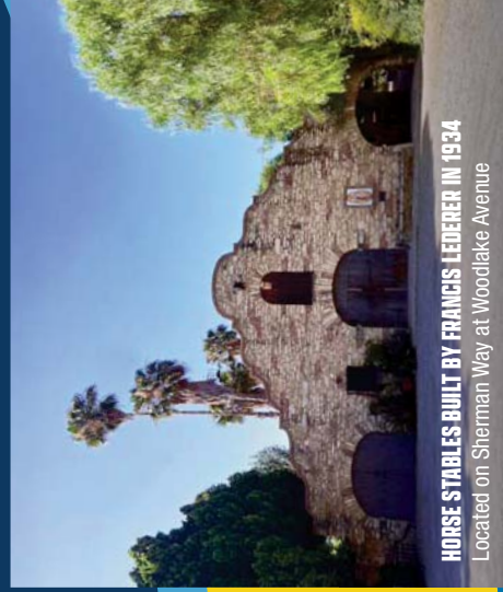
HORSE STABLES BUILT BY FRANCIS LEDERER IN 1934

Located on Sherman Way at Woodlake Avenue