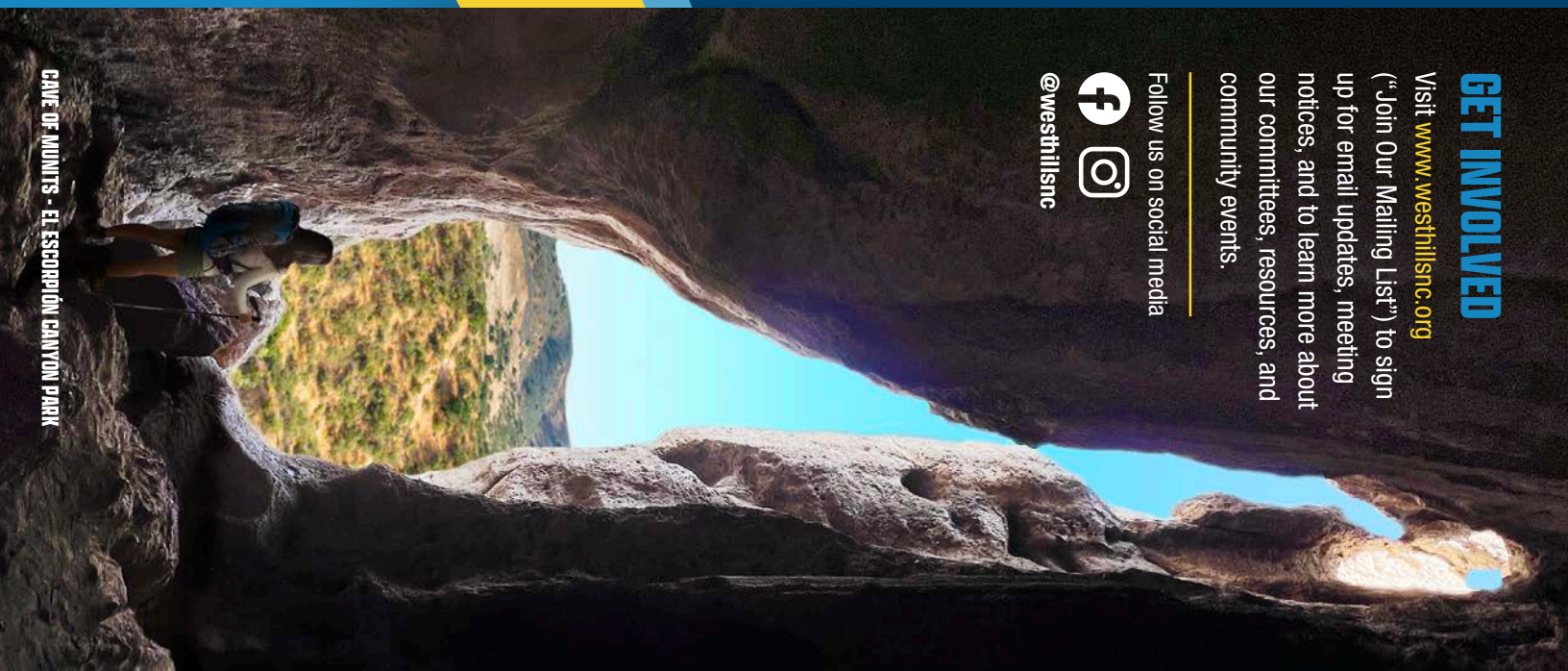
CANE OF MOUNTAINS - EL ESCORPION CANYON PARK