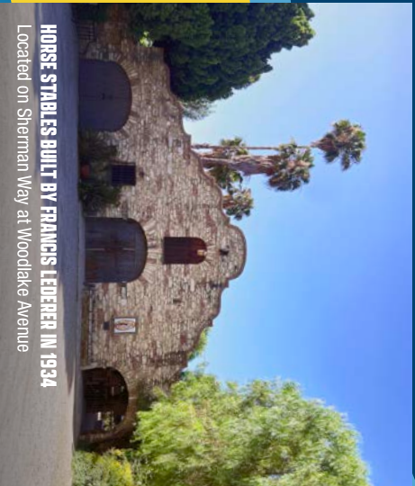
HORSE STABLES BUILT BY FRANCIS LEDERER IN 1934 Located on Sherman Way at Woodlake Avenue