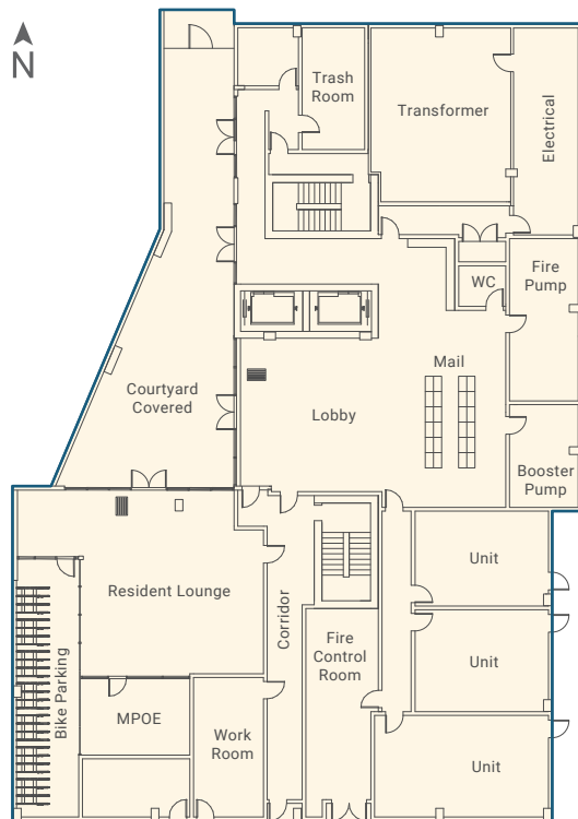
Level 1 Building Area 9,426 sf