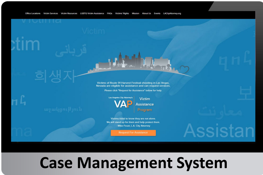
Case Management System

Visit helplacrimevictims.org or download our app to get resources, find office locations, and request assistance from Los Angeles City Victim Advocates.